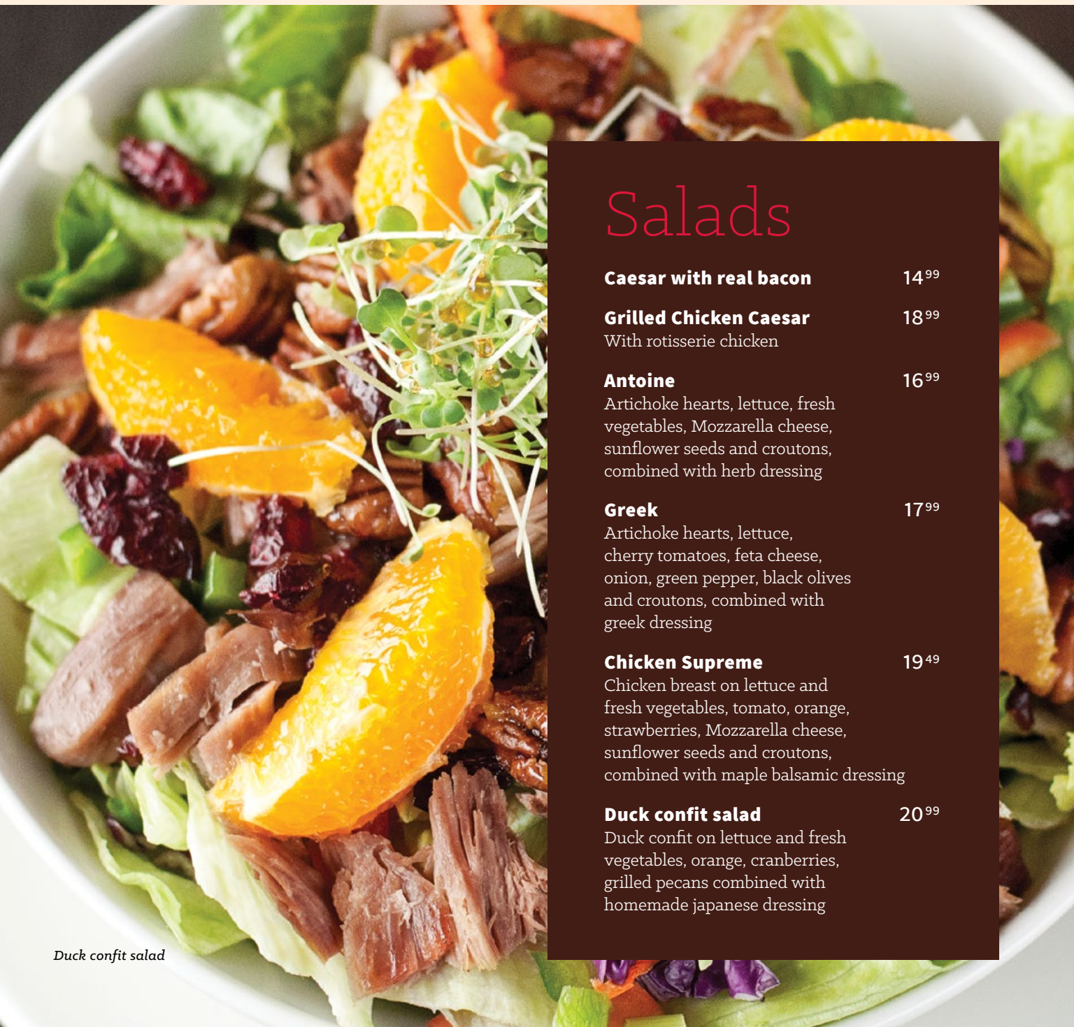
Duck confit salad