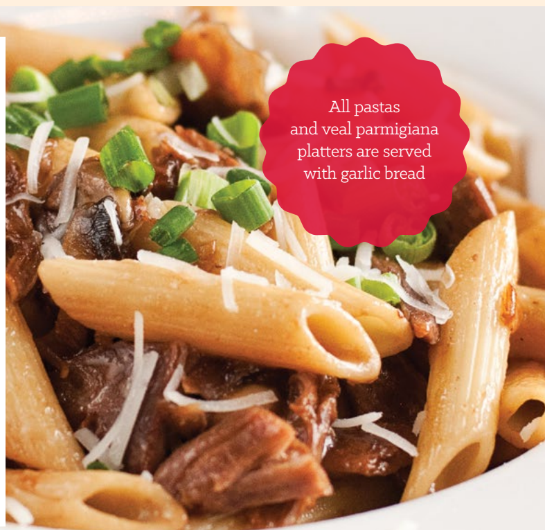
Duck confit Penne

All pastas and veal parmigiana platters are served with garlic bread